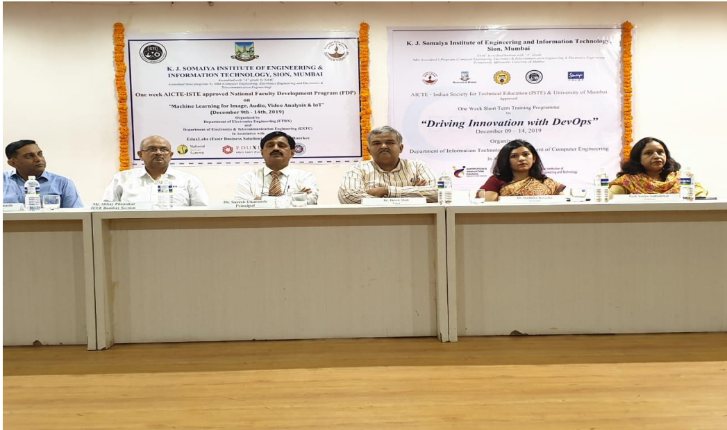
Inauguration of FDP