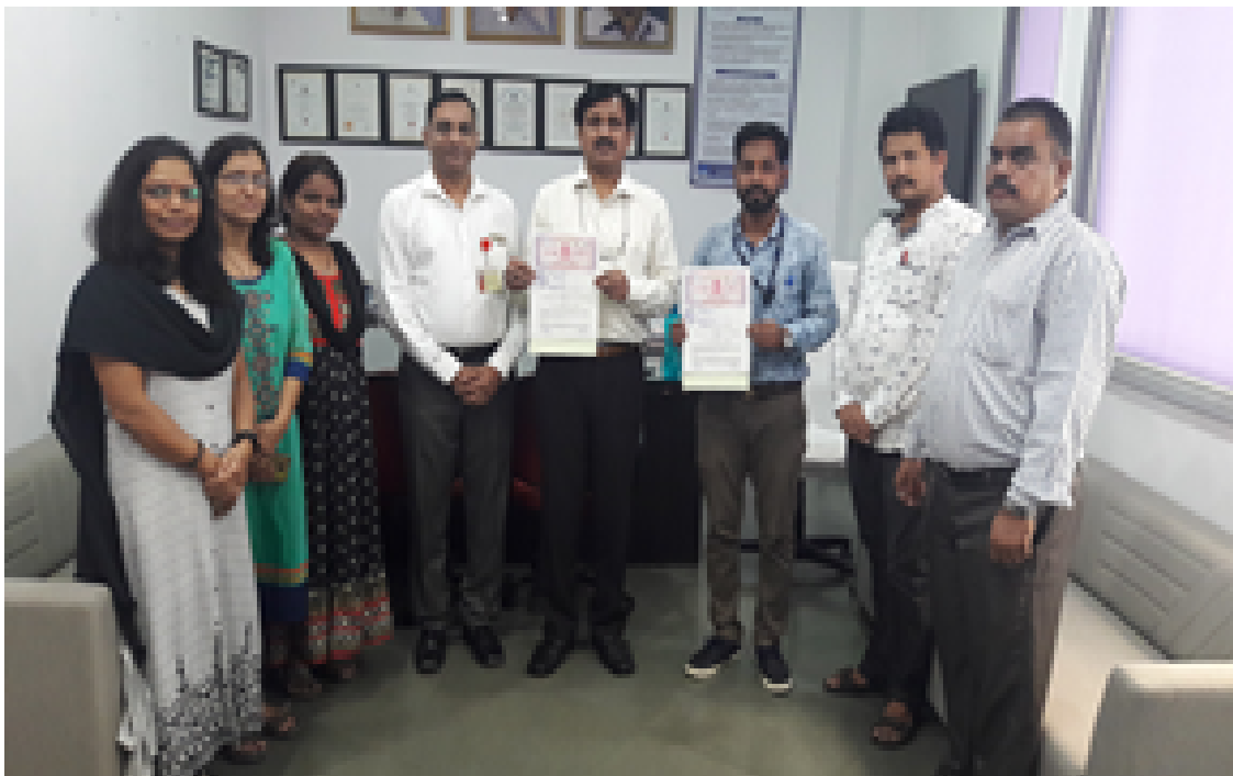
MoU signed with SMEC Automation Pvt Ltd