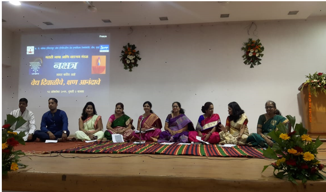
Participants of “Nakshatra” Program