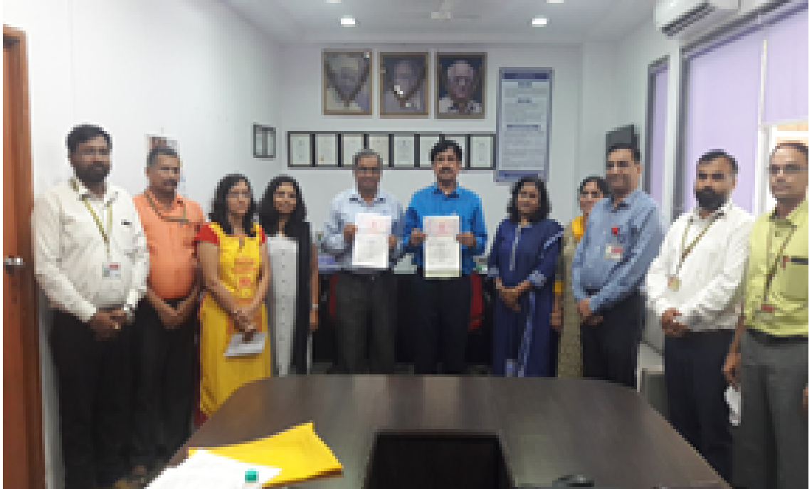
MoU signed with Tata Power Skill Development Institute