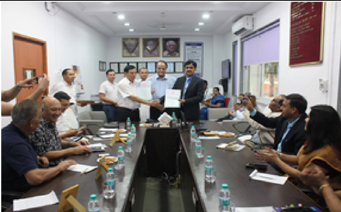
MoU signed with Namangan Institute of Engineering and Technology, Uzbekistan