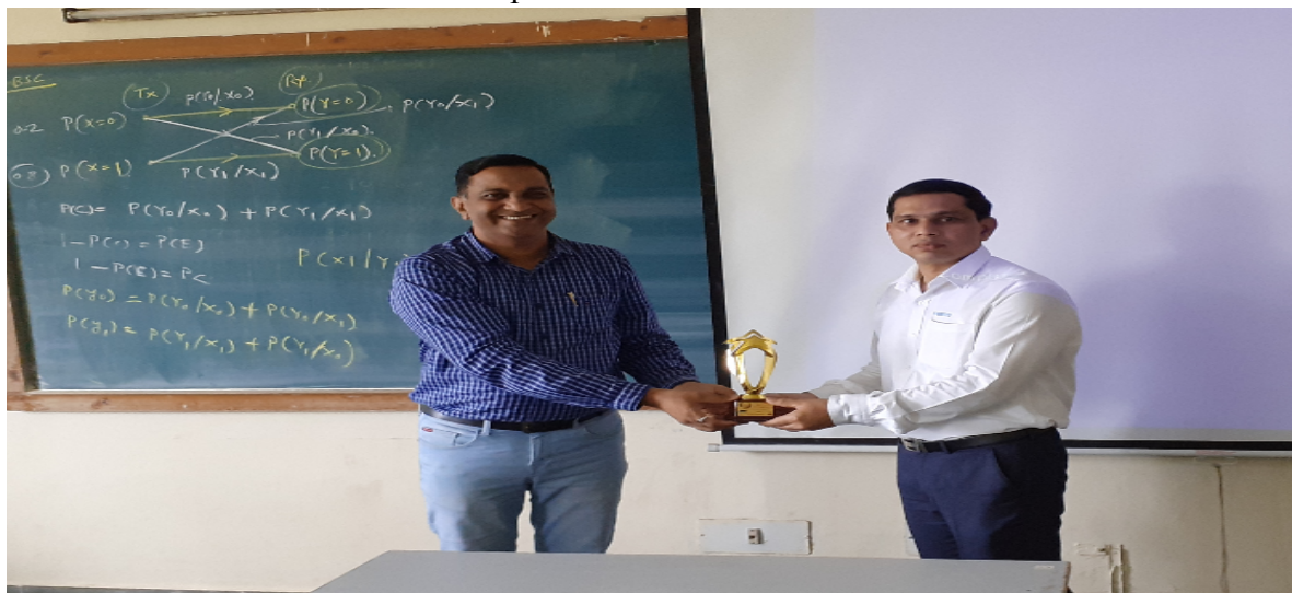
Felicitation of Speaker by HOD