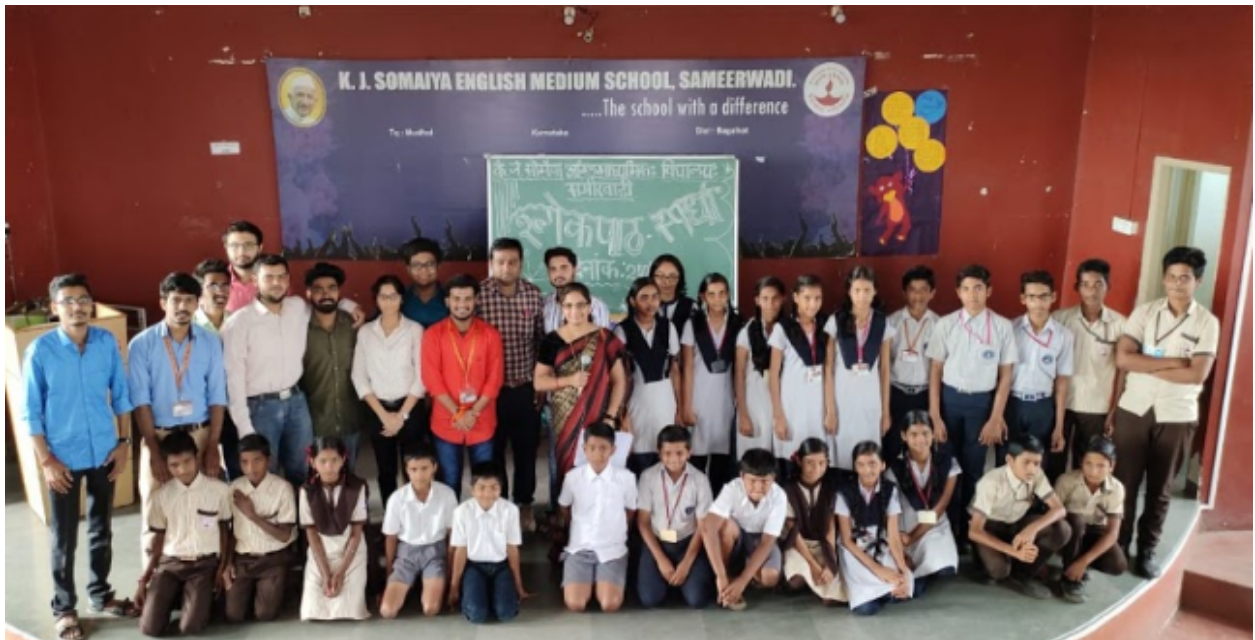
Participants in Robotics Competition