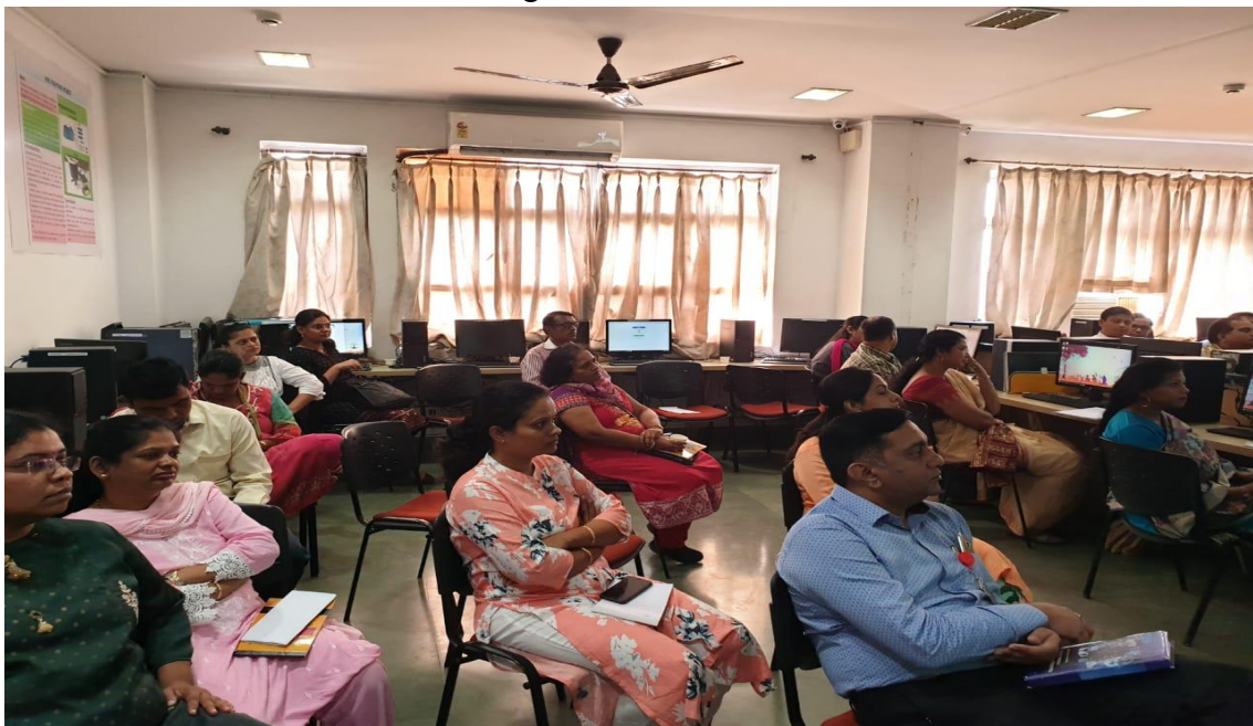
Participants in FDP