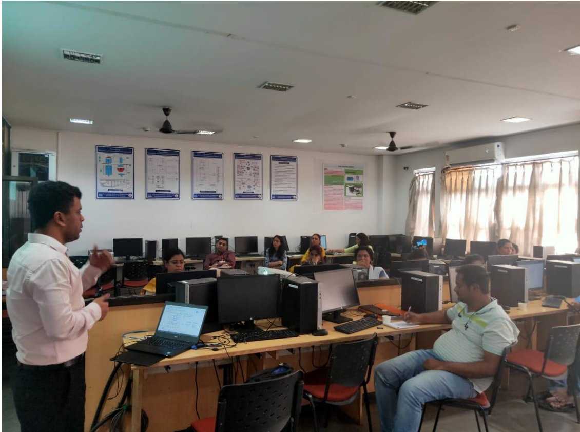
Expert Talk on Machine Learning